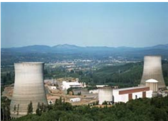
Satsop Development Park

As you travel to the beaches on Hwy 8 the defunct WPPSS nuclear towers loom large in the landscape. Now, a business development park owned by the Satsop Public Development Authority (PDA www.Satsop.com ) the towers may soon be home to a regional training center that provides pre-apprenticeship training, offers a