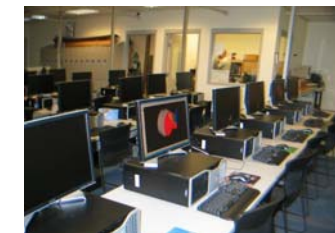
State-of-the Art Equipment

Responding to the specific training needs of business creates employment opportunities for those seeking jobs or for those wanting to upgrade their skills. WIRED looks for ways to partner with business in ways that offer higher