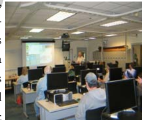
May 2 Open House

L ocal employers frequently express a need for short-term, technical training in a wide variety of in-demand occupations. Computer Manufacturing Technology (CMT) is one of those much needed by local businesses. Collaborating with South Puget Sound Community College and the New Market Skills Center, WIRED created a two-quarter program where students will learn to use mechanical design software to operate robotic numerical control machines. Completion of this program may lead to careers such as CAD/CAM Computer Programmer with entry-level wages ranging from $15 to $30 per hour. On May 5 the first class of 24 students began